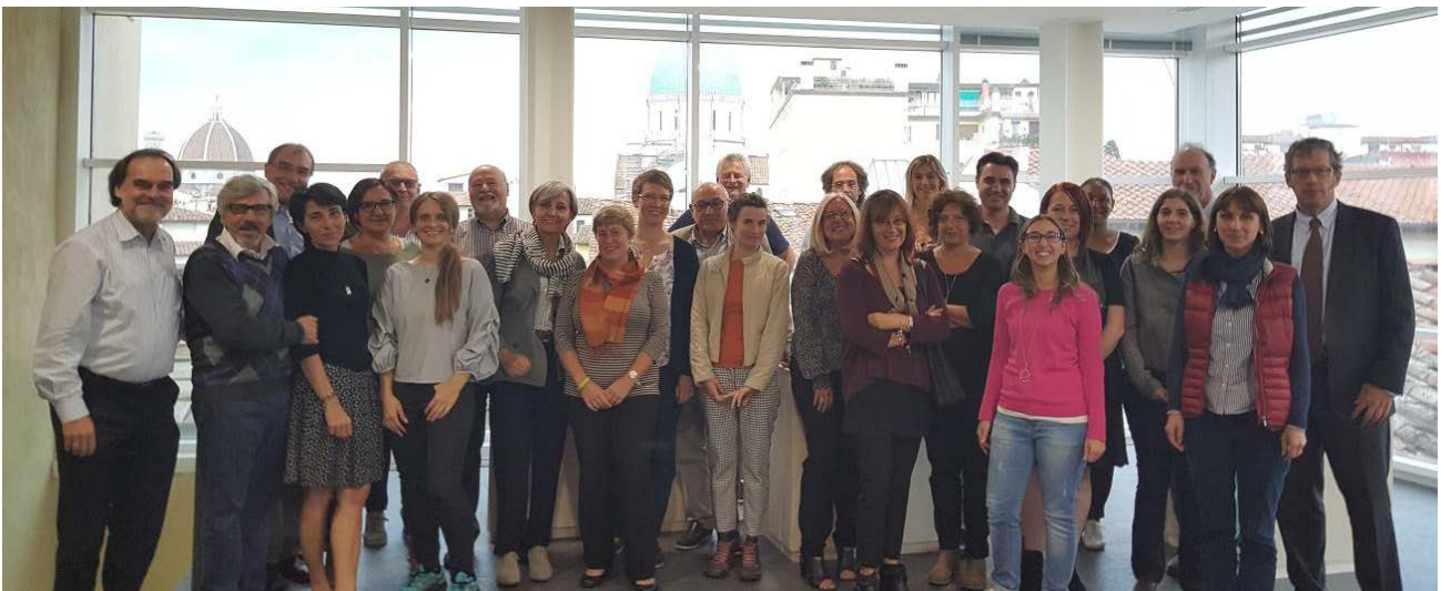
SPIDIA4P Partners at the SPIDIA4P meeting in September 2017 in Florence, Italy

Colophon SPIDIA4P, QIAGEN GmbH - QIAGEN Strasse 1 - 40724 Hilden - Germany If you are not interested in SPIDIA4P news any more, please reply to this e-mail with subject unsubscribe. COPYRIGHT © 2017-2018 SPIDIA.EU