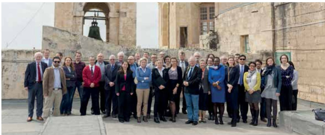
ADOPT BBMRI-ERIC team of academics on the rooftop of the Valletta Campus building, University of Malta

The first six months of ADOPT BBMRI-ERIC has now passed since the start of the project in October 2015 and the sleeves have been rolled up for the hard work to come. A team of 36 academics from 16 different Member States gathered in beautiful Valletta in mid March to discuss and update each other on the progress of the project. The ADOPT team also had a chance to meet with the accomplished members of the International Advisory Committee who observed the project work, and gave strategic advice on the course and future of ADOPT BBMRI-ERIC. While the meeting in Valletta started as any other EU-project gathering with Work Packages presenting their achievements, highlights