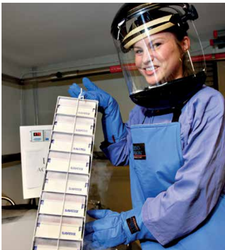
Norway - HUNT - Biobank liquid nitrogen storage

sity of Oslo, the University of Bergen, the Norwegian University of Science and Technology (NTNU) and the University of Tromsø was organised already in 2002. In 2010, when BBMRI.no/Biobank Norway, was established and funded as a national research infrastructure by the Research Council of Norway (RCN), all the clinical biobanks and the serum biobank of the Norwegian Cancer Registry were also included as partners in BBMRI.no. To have both clinical and population based biobanks onboard since 2010 has been a special strength and has promoted the establishment of a lar-