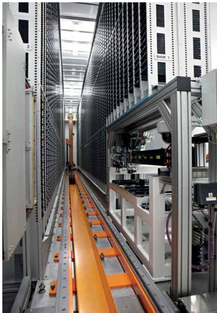
Automated storage NIPH-Biobank Oslo

The main objective is to be the major driving force in building up a European biobank network and facilitate access to sample collections from partner biobanks, their services and technical and scientific expertise. An area of special importance is to agree upon