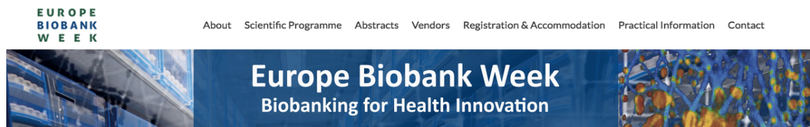
Image 3: Europe Biobank Week Conference