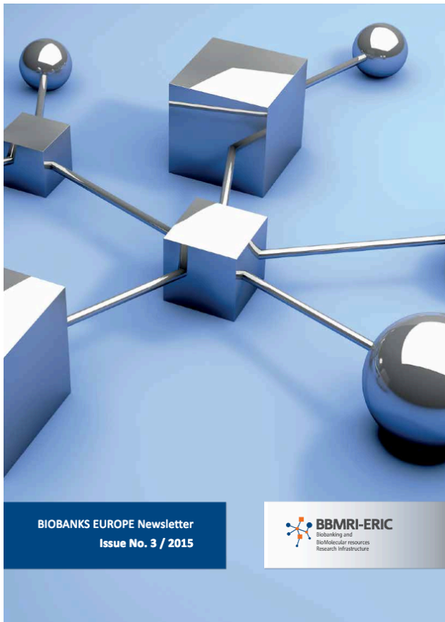
Figure 3 A cover of a Biobanks Europe Magazine in 2015.

BBMRI-ERIC e-Newsflash no 29 (19 December 2016)